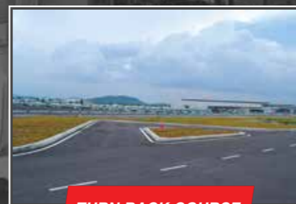
TURN BACK COURSE

To train drivers to park in a 'narrow' parking space.