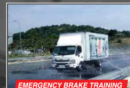
EMERGENCY BRAKE TRAINING ON WET ROAD

To train drivers to park correctly between other vehicles.